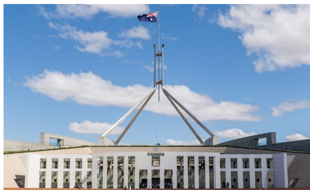
The Coronavirus has kept our Federal Government very busy.

The Coronavirus has led to an unprecedented response from the Commonwealth Government in the form of stimulus. In the section below on the sharemarket, we discuss the historical basis for government stimulus at times of economic downturn. In this section, we thought we should start this month's newsletter with a recap of Commonwealth Government stimulus payments (yes, they are technically known as stimuli).