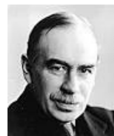
John Maynard Keynes

Many of the lessons that are being applied in Australia in the 21 st century spring from the experiences of world economies during the Great Depression described above. Perhaps the most vital set of learnings from the Great Depression came from the mind of John Maynard Keynes, a British economist. Using the knowledge that there are two broad sectors within a capitalist economy – the public sector (that is, Government) and the private sector (that is, everything except the Government), Keynes identified that there are periods within the economic cycle when the Government sector needs to take the lead. These periods were times of relatively low private sector activity, which were typically times when the economy as a whole was either slowing down or contracting. During these times, the profit-seeking private sector could not really be expected to increase investment and employment – two things that need to happen for an economy to recover and growth to recommence.